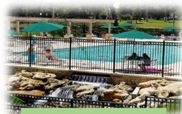
Parks & Recreation